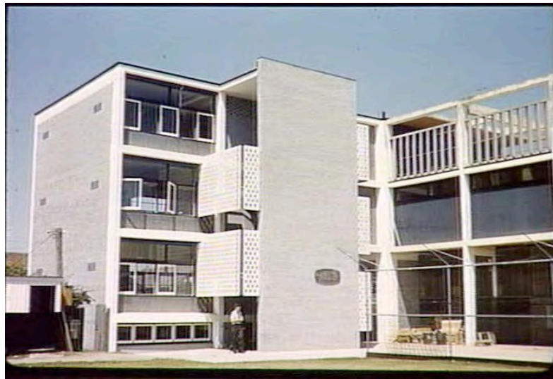
Figure 5 Science Wing, 1961, west elevation, State Library of Victoria, photograph by Peter Wille

The final major works to the building were undertaken in 1971. An additional Science Wing, again to designs by Mockridge Stahle & Mitchell, was constructed on the north side of the earlier Science Wing. This structure extended the architectural expression of the earlier buildings with some variation. The north elevation of the building was clad in bluestone, forming a bookend to the west elevation of the original Bromby Street building of 1953-54.