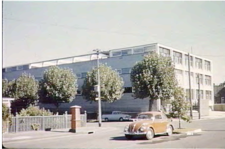
Figure 6 View of the building following the construction of the Science Wing at the corner of Domain and Bromby Streets, State Library of Victoria, photograph by Peter Wille.

Their first major commission was probably Bishop Bate's house at Olinda (1948). Their appointment as architects for Melbourne Grammar came almost as soon as wartime austerity began to recede and architects could branch into medium-sized institutional buildings. George Mitchell was the primary Melbourne Grammar connection, having been an old boy. Their first complete building undertaken for Melbourne Grammar was the Yarra boathouse (1953). The Bromby Building was the second, being documented in 1954. Mockridge Stahle & Mitchell followed this with the Centenary Building in 1959 and the Science Wing in 1961. The firm remained Melbourne Grammar's architects from 1952 until 1985.