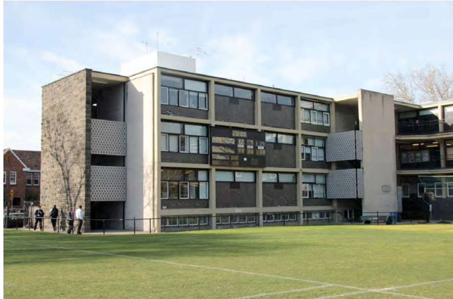
Figure 7 Bromby Building, Science Wing (1961, on right) and New Science Wing (1971, on left).